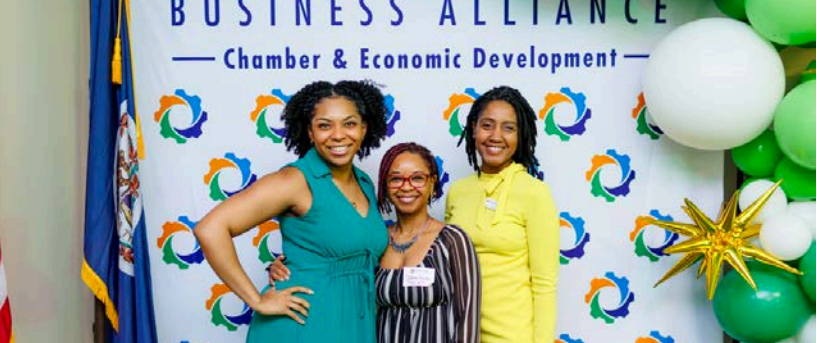
TABLE PARTNER* | $1,200